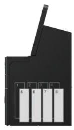
8-coin bag storage